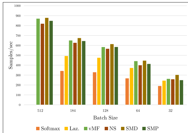
Figure 2: Speed comparisons. We compare the number of training instances that can be processed per second for each loss formulation. Syn-margin is found to be faster than other margin-based methods, and comparable in speed to vMF.

Comparing translations produced by vMF and syn-margin models in the Fr→En task, we find SMP translations to be more grammatical. They better preserve grammatical information such as gender (SMP correctly predicts the fragment ‘her personality’ while vMF generates ‘his personality’) and tense (SMP generates ‘does it predict’