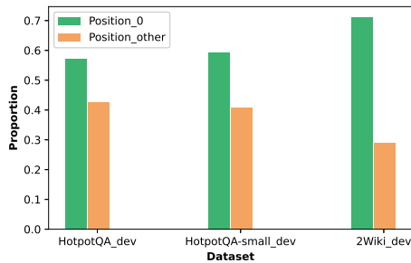
Figure 2: Information on the position of sentence-level SFs in the dev. sets of the three datasets.

sentence-level SFs prediction task was first introduced by Yang et al. (2018). This task requires a model to predict a set of sentences that is necessary to answer a question (Figure 1).