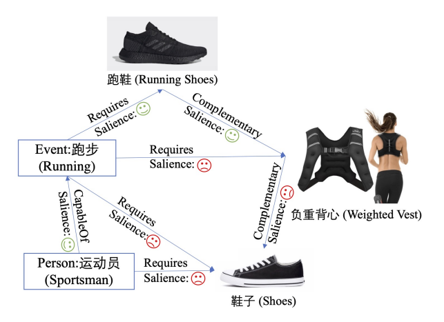
Figure 1: An excerpt from an e-commerce network of commonsense knowledge. Although all the commonsense knowledge is plausible, only the knowledge with a green face is salient, which is beneficial for product search and recommendation.

Intuitively, the salience of commonsense knowledge is important and cannot be ignored. To be