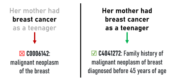
Figure 2: Concept mapping sometimes requires considering the entire sentence, rather than mentions.