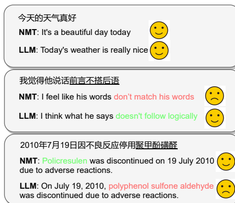
Figure 1: A comparison of translations done by an NMT model and LLM. They translate simple content equally well but their performances vary when translating complex sentences.

Methods to harness complementary strengths of NMT and LLM models, with the aim of achieving better translation results through their integration, are worthy of research. To integrate large and small models, Zeng et al. (2024) propose Cooperative Decoding while Farinhas et al. (2023) put forward an approach based on Minimum Bayes Risk (MBR). While these methods are effective in improving translation quality, their reliance on LLMs for every piece of translation incurs substantial computational expenses.