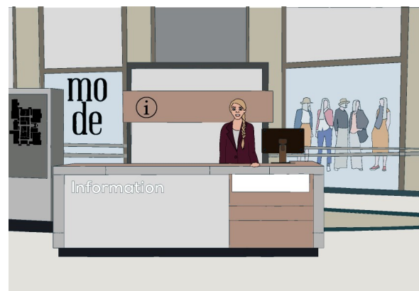
Figure 3. The cashier's desk. Access to this scene requires an item in the pupil's shopping basket. Exit from this scene to the Department Store's main hall requires a successful payment.