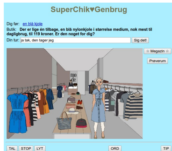
Figure 2. SuperChik, a second-hand clothing shop in the Department Store environment.

As illustrated in fig.2, the three most recent turns remain visible. The line "Dig før: en blå kjole " ( You before: a blue dress ) quotes the pupil (and also links to the TTS playback). The next line is the attendant's turn (here describing a particular dress). The third line "Din tur: ja tak, den tager jeg" ( Your turn: OK, I'll take it ) has just been entered by the pupil, but not sent yet. Pressing "Sig det!" at this point will have the effect of a classical speech act. The attendant will acknowledge the sale transferring the commodity to the pupil's basket, while the gate panel (right side) will change accordingly replacing gate "Megazin" (building exit) by a new gate "Kassen" ( Cashier , fig.3).