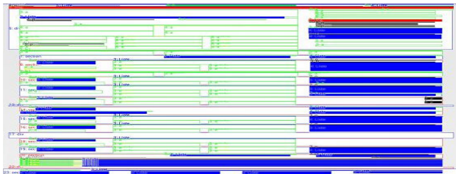
Figure 2. A graphical representation for a page web (leparisien.fr)

To illustrate results of applying previous two mentioned approaches, we represented an obtained filtered DOM-tree on the used tablet. Figure 2 views a graphical representation for a page web, since each rectangle represents a block in the analyzed web page. Red rectangles represent images (<img> tags), green rectangles represent links (<a> tags), blue rectangles represent list of items (<ul> or <ol> tags), and finally, black rectangles represent paragraphs (<p> tags).