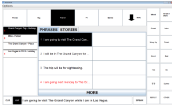
Figure 3 - System interface