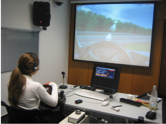
Figure 2: Experiment setup

The personal/impersonal style variation is not applicable for some dialogue moves, e.g., (9), and for output in telegraphic style.