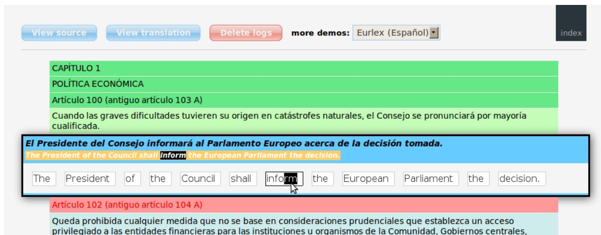
Figure 3: Demo interface. The source text segments are automatically extracted from source document. Such segments are marked as pending (light blue), validated (dark green), partially translated (light green), and locked (light red). The translation engine can work either at full-word or character level.