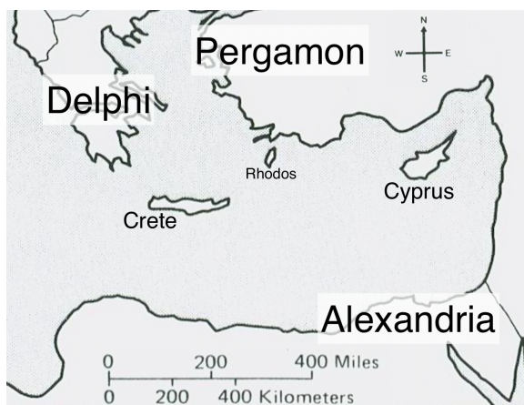
Figure 1: A map showing relative position on three potential regions relevant for authorship attribution of Pseudo-Plutarch documents.

a region surrounding Delphi, where Plutarch was working, a region in the proximity of Alexandria, and the region of ancient Ionia, namely the ancient region on the central part of the western coast of modern Anatolia, see Figure 1. After balancing texts written by authors in these three regions with the fourth label that includes random sentences from authors outside of these regions, we train another BERT-based classifier to achieve a 0.79 validation accuracy for the region of the author. Table