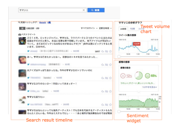
Figure 1: Result page of the tweet search/analysis service

Now let us assume that we are evaluating how appropriate a target tweet v is according to an RNN encoder-decoder model given a corresponding source tweet u, i.e., computing p(v|u). For the preprocessing, we encode tweets into se-