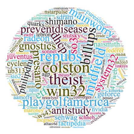
Figure 3: The top 10 words for each word embeddings' dimension.

Given the sparsity of word embeddings, one natural question would be: What are those key words that are leveraged by the model to make predictions? To this end, after training SWEM-max on Yahoo! Answer dataset, we selected the top-10 words (with the maximum values in that dimension) for every word embedding dimension. The results are visualized in Figure 3. These words are indeed very predictive since they are likely to occur in documents with a specific topic, as discussed above. Another interesting observation is that the frequencies of these words are actually quite low in the training set (e.g. colston: 320, repubs: 255 win32: 276), considering the large size of the training set (1,400K). This suggests that the model is utilizing those relatively rare, yet representative words of each topic for the final predictions.