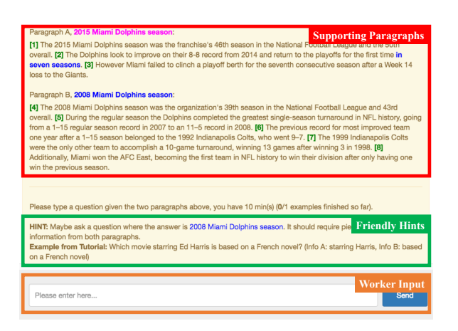
Figure 4: Screenshot of our worker interface on Amazon Mechanical Turk.

<sup>8</sup>https://github.com/attardi/ wikiextractor