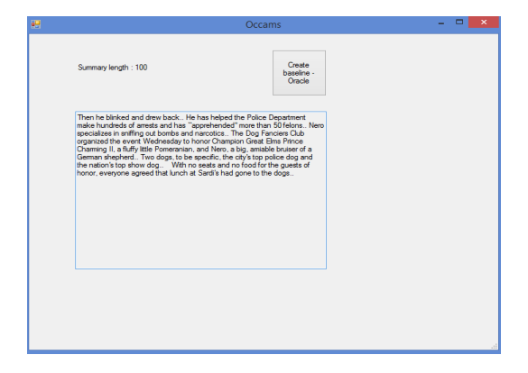
Figure 7: OCCAMS summary.

The EASY-M system standalone version is implemented in c#, and its Web version is implemented in Angular7 on the client side, and sp.net WebAPI2 on the server side. Video of the standalone interface operation is available at https://www.youtube.com/watch?v= HQhzhSQ701A&t=143s. Currently, the system