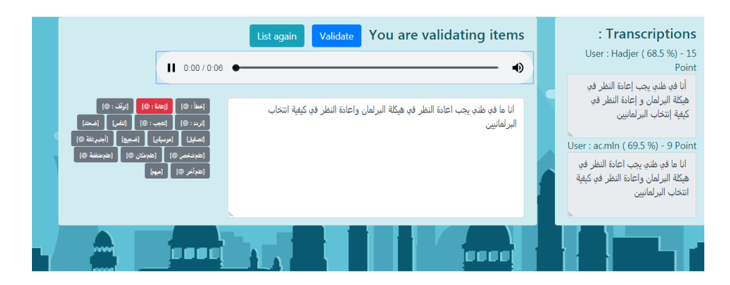
Figure 2: WTT Review and Validate Transcriptions Page