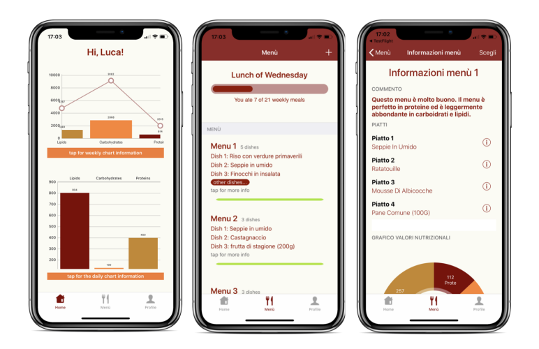
Figure 2: Three screenshots of CheckYourMeal.

The user interface is structured in three sections: the Home section, where the users are provided with general information, the Menu section, where the users can see the suggestions for the next meal and where they can input the chosen meals, and the Profile section, where the users can modify settings and user parameters. In the Menu section (central screenshot in Fig. 2), the user is presented with some suggestions of meals taken from a precompiled database of menus which are ordered by their distance from the ideal values of the dietary reference values. When a user selects a specific menu, CheckYourMeal! shows both (1) a pie-chart and (2) a textual message which contains information about the macronutrients values of the chosen menu.