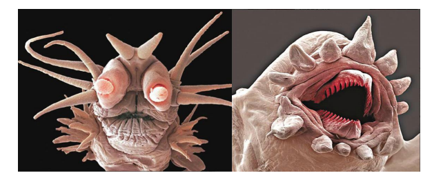
Figure 2: Photographs to trigger questions for students to respond.

To have a concrete idea about the texts submitted by students via CCR, Table 1 shows a set of real-world texts in response to the question asked by a Taiwan university teacher of General Education of Science: "As a marine researcher, if someone presents the photos shown in Figure 2 to you and ask your opinion about the creature, what would you think of and what would you ask?"