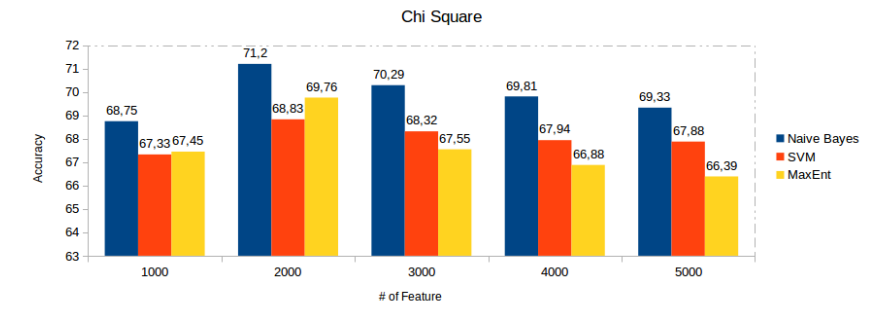
Figure 1. The classifiers performance with Chi-Square feature selection varying the number of selected features.