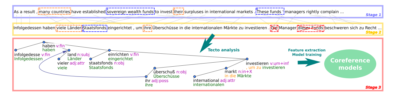
Figure 1: Architecture of the system that consists of three stages: coreference resolution in English (Stage 1), cross-lingual projection of coreference (Stage 2) and resolution in the target language (Stage 3). In the projection stage, the mention These funds ' is not projected because it is aligned to a discontinuous German span.

zation available as a module in the Treex frame-work.