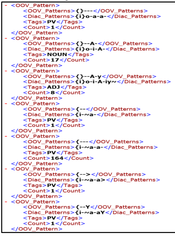
Figure 2: Patterns List with their Diacritized Patterns and Tags.

The POS helps, in some cases, in limiting the scope of the search of the matched pattern, where, for example, if the OOV word has been detected as having "لل" "Al" at the beginning of it, this means the system should search for the detected pattern in the patterns of nouns or adjectives.