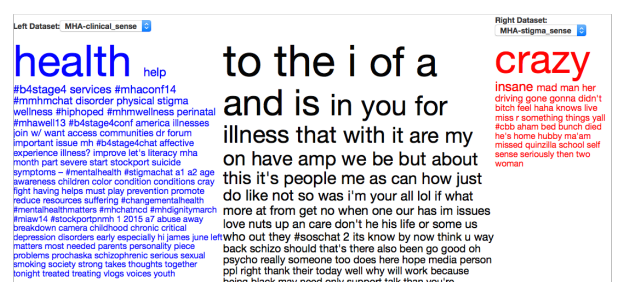
Figure 2: Vennclouds for all tweets containing the 14 stigmatizing words, as tweeted by MHA users, with words from tweets containing clinical senses of the words appearing on the left (blue text), stigmatizing senses of the words appearing on the right (red text), and the language shared by tweets containing either sense in the middle (black text).

grained (CGd) sense – and generated dynamic Vennclouds (Coppersmith and Kelly, 2014) to compare clinical-sense tweets to stigmatizing-sense tweets. Figures 2 and 3 display the resulting clouds.