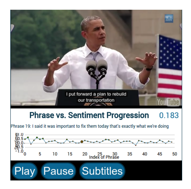
Figure 2: The graph shows the detected sentiment in the video over time, while the video keeps playing.

The project is completely open source and can be downloaded from its Github repository<sup>4</sup>.