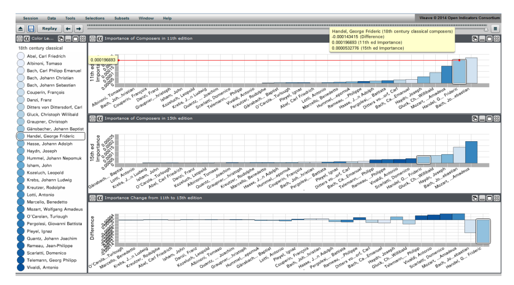
Figure 3: Biggest "movers and shakers" among the 18th century composers.