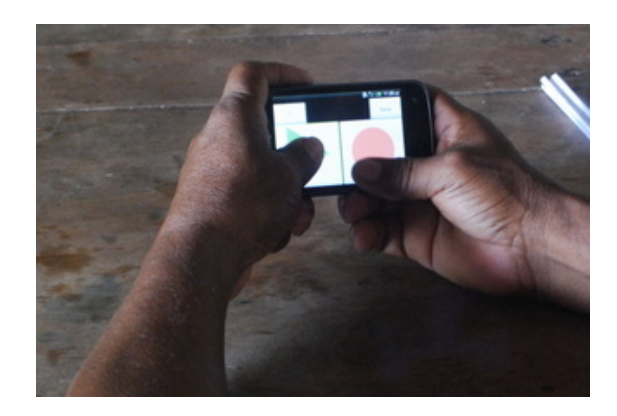
Figure 2: Adding a time-aligned translation