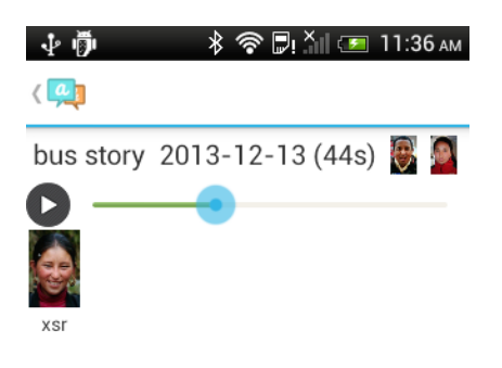
Figure 4: Recording playback screen

When a recording is selected, the user sees a display for the individual recording, with its name, date, duration, and images of the participants, cf. Figure 4.