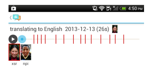
Figure 5: Commentary playback screen

The availability of commentaries is indicated by user images beneath the timeline. Once an original recording has commentaries, their locations are displayed within the playback slider. Playback interleaves the original recording with the spoken commentary, cf Figure 5.