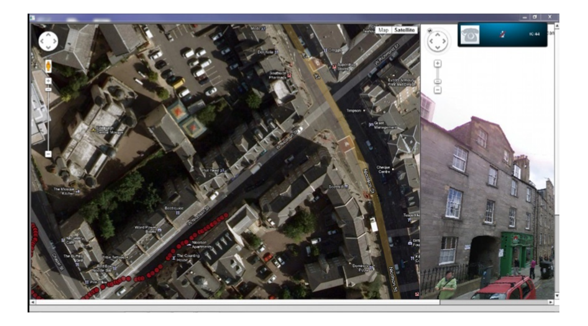
Figure 1: Wizard of Oz interface - Google Satellite Map and StreetView