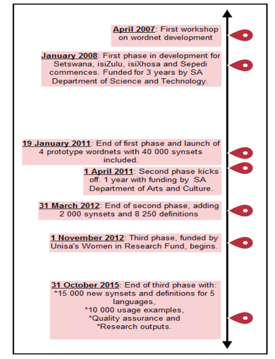
Figure. 1. Timeline of development in the African Wordnet Project.

In this paper, we reflect critically on the previous phases in development including challenges faced and solutions to some common problems. Section 3 gives a brief report on the current standing of the African wordnets and sections 4 and 5 give details regarding future work.