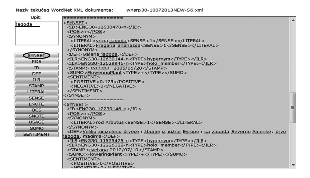
Figure 2: User-friendly XPATH queries over different SWN tags

formed. Also, they search data according to the authoring information. A search function can be either set to a simple value (Figure 2) or via a logic filter which is implemented to be user-friendly for those who are not familiar with XPath.