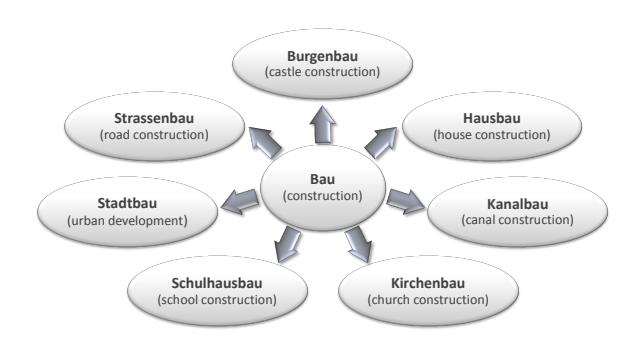
Figure 4: Map of terms based on Bau 'construction' with matching last compound elements.

heiraten 'to marry'), and variant compound forms (Lehenherr and Lehensherr 'liege').