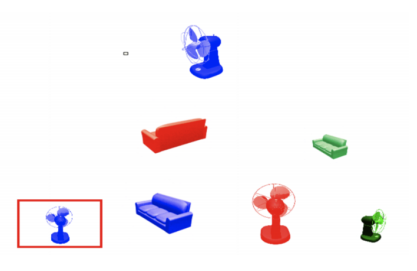
the small blue fan

petition (Gatt et al., 2009).<sup>5</sup> The TUNA data is a collection of images of domain entities paired with descriptions of entities. Each pair consists of seven entity images where one is highlighted (by a red box surrounding it), paired with a description of the highlighted entity, e.g.: