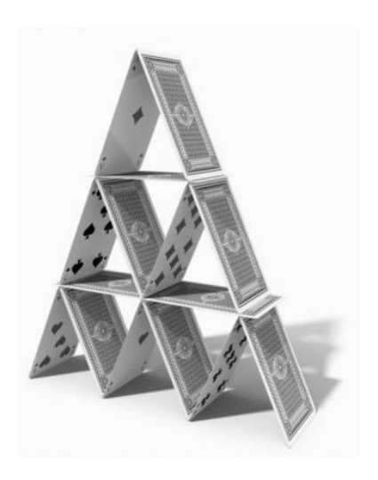
Figure 2: A pyramid built out of playing-cards.

(2004; 2007) dataset in our experiments and show that card-pyramid parsing improves accuracy over both their approach and a pipelined extractor.