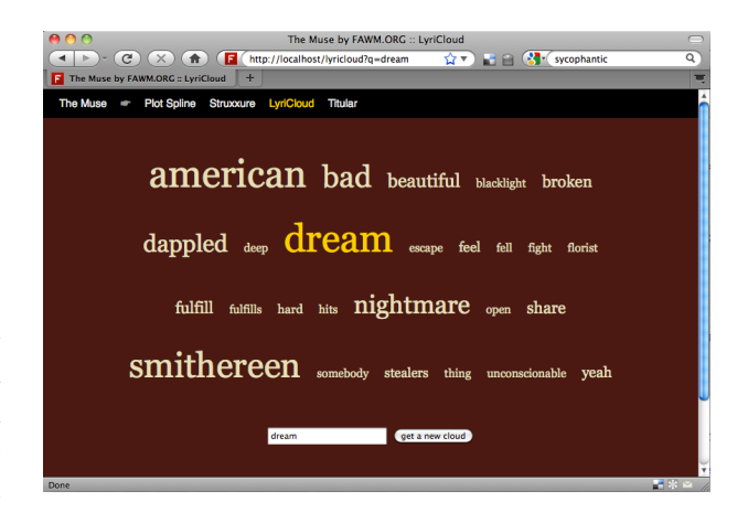
Figure 2: A screenshot of the LyriCloud user interface.

Notice that LyriCloud's notion of related words can be quite loose. Some suggestions are modifiers of the seed, like "broken dream" and "deep dream," although these invoke different senses of dream (metaphorical vs. literal). Some suggestions are part of an idiom involving the seed, such as "fulfill a dream," while others are synonyms/antonyms, or specializations/generalizations, such as "nightmare." Still other words might be useable as rhymes for the seed, like "smithereen" and even "thing" (loosely). The goal is to help the user see the seed word in a variety of senses and perspectives. Users