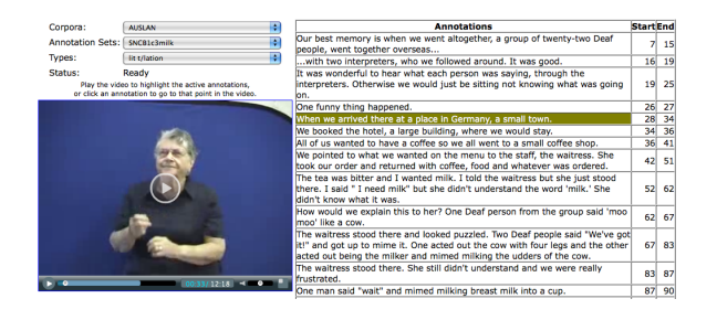
Figure 3: A screenshot from the Javascript client

The DADA system aims to provide general purpose infrastructure for collaborative annotation of language resources. Built on core semantic web technologies it provides a server based solution that is able to ingest annotation data from a number of sources and deliver them both to human browsers and to client applications. In the first