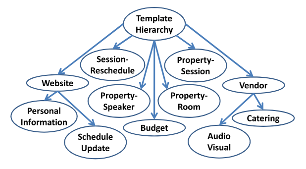
Figure 2: The category tree showing the information types that we expect in a briefing.

The Briefing Assistant Model: We treat the task of briefing generation in the current domain<sup>1</sup> as non-textual event-based summarization. The