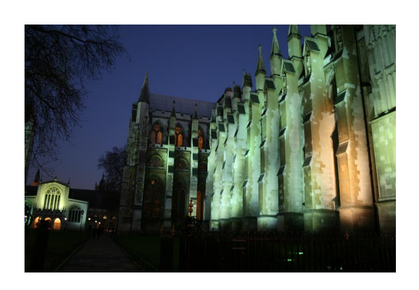
Figure 2: Example image