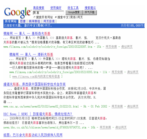
Figure 2: A web page returned by Google

non-Chinese letters and common words containing more than one character. From the remaining string segments in \underline{\mathbf{R}}^{(m)} , we locate all sub-strings with at