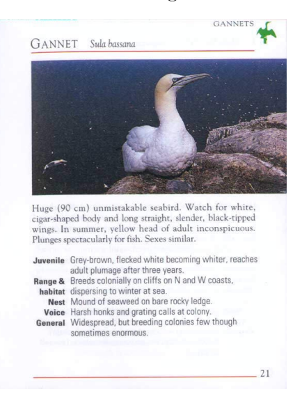
Figure 2: Example page: Flegg, J. (1999) Collins Gem Birds. Italy: Harper Collins. p21. Used by kind permission of the publisher.

the advantage that it is relatively straightforward; more complex examples can be found on the corpus webpages.