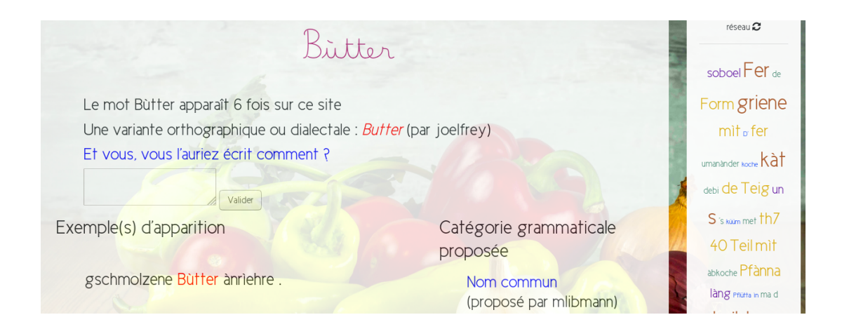
Figure 2: Spelling addition using the wordcloud. The word is shown in its context, with the proposed part-of-speech (if available).