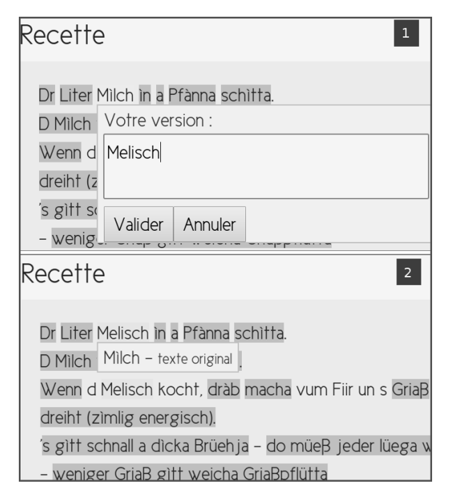
Figure 3: Spelling addition (1) and visualization (2) (highlighted words present at least one additional variant).

terpreted as elements of context. The rules are extracted from each pair of the combination of the aligned variants. From the aligned variants (1) and (2) showcased in Figure 1, four L+R rules are extracted: LR \leftrightarrow LER; RÌE \leftrightarrow RIE; EWL \leftrightarrow EBL; HE$ \leftrightarrow HA$. The eight left-and-right-context-only corresponding rules are deduced from the L+R rules.