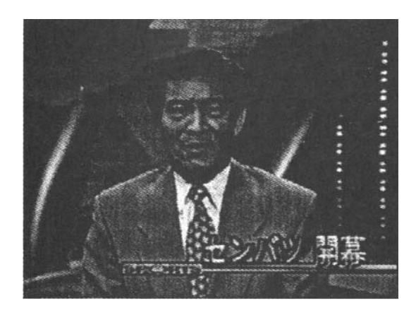
Figure 4: An example of title texts: "zantei yosanan asu shu-in tsuka he (The House of Rep. will pass the provisional budget tomorrow)"