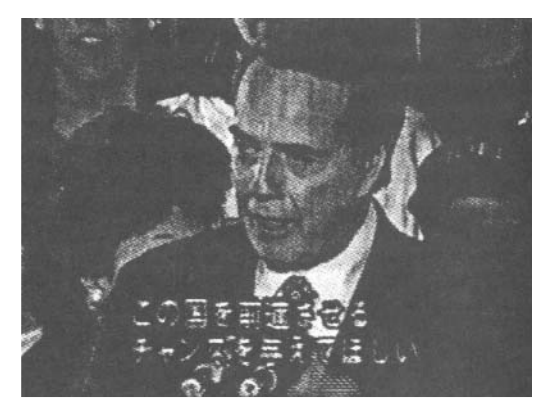
Figure 6: An example of a quotation of a speech: "kono kuni wo zenshin saseru chansu wo atae te hoshii (Give me a chance to develop our country)"

mation and may contain inadequate words for aligning articles. Figure 6 shows an example of a quotation of a speech.