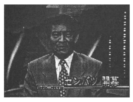
Figure 8: An example of a sports news article: "senbatsu kaimaku (Inter-high school baseball games start)"

exchange. It is because the styles of these kinds of TV news articles are fixed and quite different from those of the others. From this, we concluded that we had better align these kinds of TV news articles by the different method from ours. As a result of this, we omitted TV news articles the title text of which had the special underline for these kinds of TV news articles. For example, Figure 8 shows a special underline for a sports news.