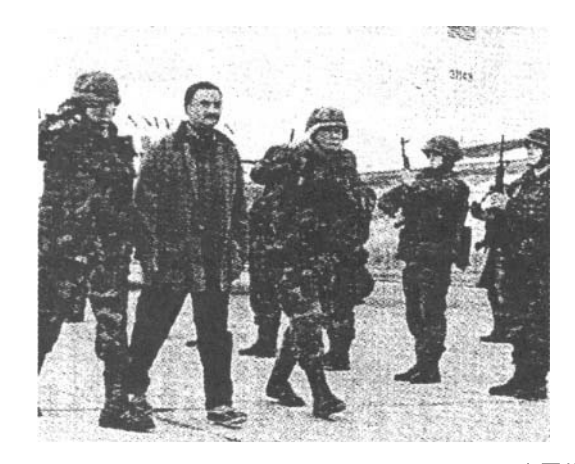
《写真》ボスニア・ヘルツェゴビナのツズラにある空軍基地に到着、軍用のボーイング 737 型機から降りて兵士たちの出迎えを受けたブラウン米商務長官。この後、同じ飛行機に再び乗ってドブロブニクに向かう途中に事故が起きたニロイター

米国人はポスニアで、和平協議を推進した外交官3人 が昨年夏、事故で死亡した。今年1月には、米兵2人が やはり事故で死亡した。