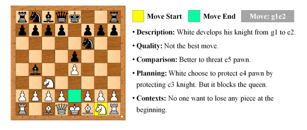
Figure 1: Chess Commentary Examples.

With games exploding in popularity, the demand for Natural Language Generation (NLG) applications for games is growing rapidly. Related researches about generating real-time game reports (Yao et al., 2017), comments (Jhamtani et al., 2018; Kameko et al., 2015), and tutorials (Green et al., 2018a,b) benefit people with entertainments and learning materials. Among these, chess commentary is a typical task. As illustrated in Figure 1, the commentators need to understand the current board and move. And then they comment about the current move (Description), their judgment about the move (Quality), the game situation for both sides (Contexts), their analysis (Comparison) and guesses about player's strategy (Planning). The comments provide valuable information about what is going on and what will happen. Such information not only make the game more enjoyable for the viewers, but also help them learn to think and play. Our task is to design automated generation model to address all the 5 sub-tasks (Description, Quality, Comparison, Planning, and Contexts) of single-move chess commentary.