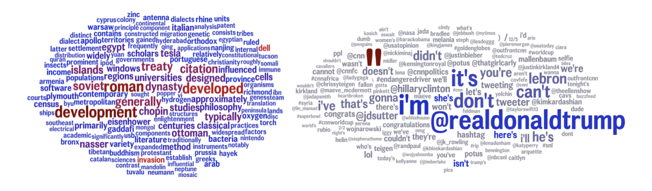
Figure 2: Visualization of vocabulary differences between SQuAD (left) and TWEETQA (right). Note the presence of a heavy tail of hash-tags and usernames on TWEETQA that are rarely found on SQuAD. The color range from red to gray indicates the frequency (red the highest and gray the lowest).