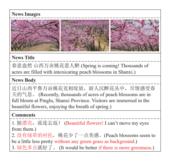
Figure 1: An example in the constructed dataset. Red words indicate the content that is not included in the text but depicted in the images.

Due to the importance described above, some work (Qin et al., 2018; Lin et al., 2018; Ma et al., 2018) has explored this task. However, these efforts are all focus on automatic commenting based solely on textual content. In real-scenarios, online