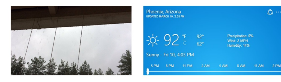
(a) "What a wonderful weather!"

(b) "Yep, totally normal <user>. Nothing is off about this. Nothing at all. #itstoohotalready #climatechangeisreal"