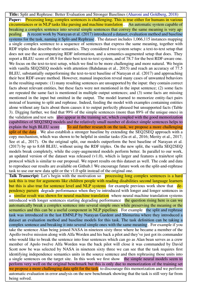
Table 3: Alignment example between a paper's Introduction section and first 2:40 minutes of the talk's transcript. The different colors show corresponding content between the transcript to the written paper. This is the full-text version of the example shown in Table 1.

This section elaborates on the example presented in Table 1. Table 3 extends Table 1 by showing the manually-labeled alignment between the complete text of the paper's Introduction section, and the corresponding transcript. Table 4 shows the alignment obtained using the HMM. Each row in this table corresponds to an interval of consecutive time-steps (i.e., a sub-sequence of the transcript) in which the same paper sentence was selected by the Viterbi algorithm. The first column (Paper Sentence) shows the selected sentences; The second column (ASR transcript) shows the transcript obtained by the ASR system; The third column (Human transcript) shows the manually corrected transcript, which is provided for readability