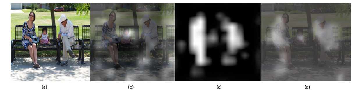
Figure 3: Question: "How many people are in the image?" Answer: "three" a) Original image b) Attention map generated by previous state of the art approach c) Our low resolution segmentation map guidance d) Attention map generated by our SegAttendnet Model

input image and to subsequently refine it's internal representation at each time step based on the new input it receives.