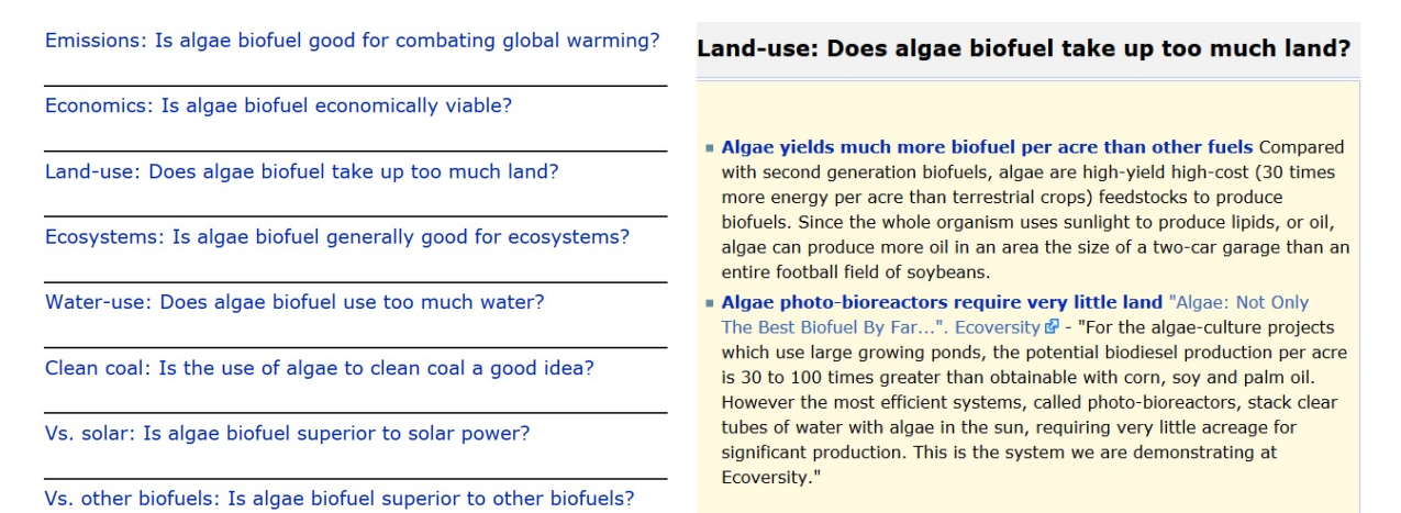
Figure 1: Queries associated with the topic "algae Figure 2: Documents and summaries for a given biofuel" query