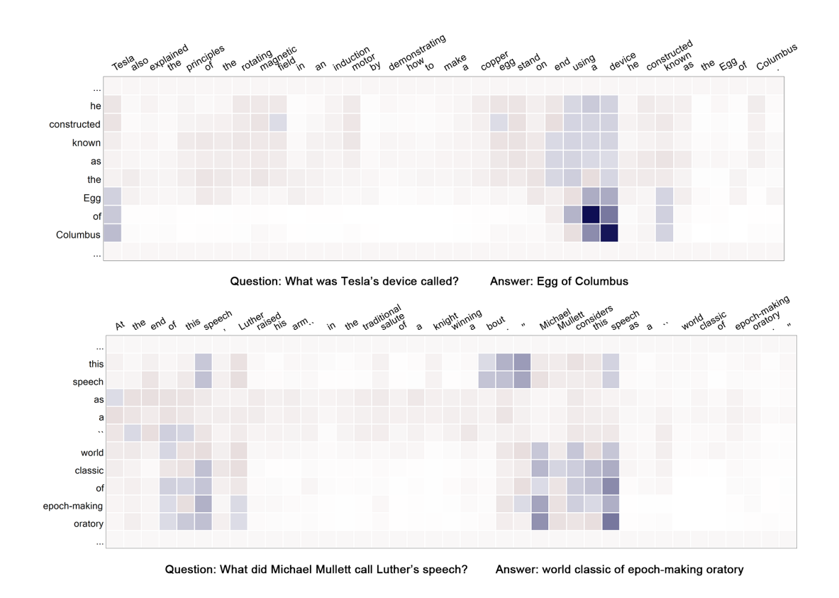
Figure 2: Part of the attention matrices for self-matching. Each row is the attention weights of the whole passage for the current passage word. The darker the color is the higher the weight is. Some key evidence relevant to the question-passage tuple is more encoded into answer candidates.

attention-based recurrent network (GARNN) and self-matching attention mechanism positively contribute to the final results of gated self-matching networks. Removing self-matching results in 3.5 point EM drop, which reveals that information in the passage plays an important role. Characterlevel embeddings contribute towards the model's performance since it can better handle out-ofvocab or rare words. To show the effectiveness of GARNN for variant RNNs, we conduct experiments on the base model (Wang and Jiang, 2016b) of different variant RNNs. The base model match the question and passage via a variant of attentionbased recurrent network (Wang and Jiang, 2016a), and employ pointer networks to predict the answer. Character-level embeddings are not utilized. As shown in Table 4, the gate introduced in question and passage matching layer is helpful for both GRU and LSTM on the SQuAD dataset.