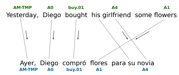
Figure 4: Annotation projection for a word-aligned English-Spanish sentence pair.

In the next sections, we briefly describe the creation of the labeled data and the training of the SRL systems, followed by a tour of the Web UI.