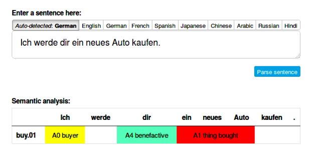
Figure 1: Example of POLYGLOT predicting English Prop-Bank labels for a simple German sentence: The verb "kaufen" is correctly identified to evoke the BUY.01 frame, while "ich" (I) is recognized as the buyer, "ein neues Auto" (a new car) as the thing bought, and "dir" (for you) as the benefactive.

Semantic role labeling (SRL) is the task of labeling predicate-argument structure in sentences with shallow semantic information. One prominent labeling scheme for the English language is the Proposition Bank (Palmer et al., 2005) which annotates predicates with frame labels and arguments with role labels. Role labels roughly conform to simple questions ( who, what, when, where, how much, with whom ) with regards to the predicate. SRL is important for understanding natural language; it has been found useful for many applications such as information extraction (Fader et al., 2011) and question answering (Shen and Lapata, 2007; Maqsud et al., 2014).