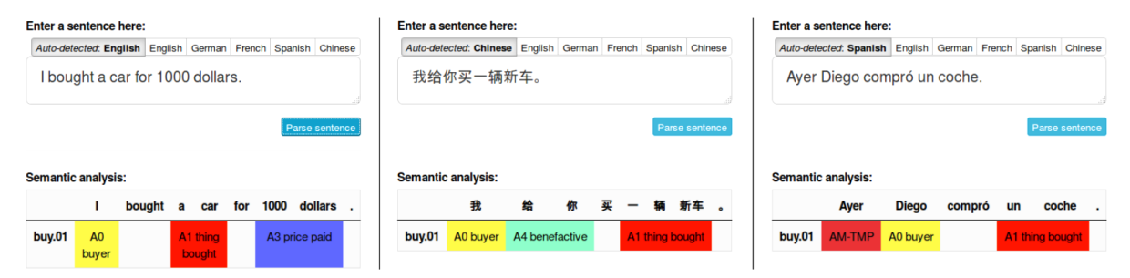
Figure 2: Side by side view of English, Chinese and Spanish sentences parsed in POLYGLOT'S Web UI. English PropBank frame and role labels are predicted for all languages: All example sentences evoke the BUY.01 frame and have constituents accordingly labeled with roles such as the buyer , the thing bought , the price paid and the benefactive .

all target languages, while the latter use languagespecific labels. As such, the auto-generated Prop-Banks allow us to train an SRL system to consume text in various languages and make predictions in a shared semantic label set, namely English Prop-Bank labels. Refer to Figures 1 and 2 for examples of how our system predicts frame and role labels from the English Proposition Bank for sentences in German, English, Chinese and Spanish.