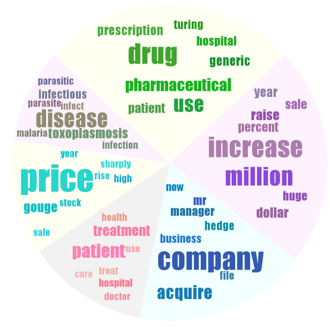
Figure 2: Topic Cloud of the pharmaceutical company acquisition news.