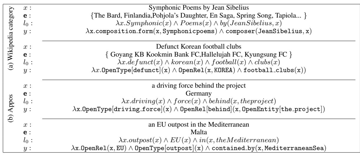
Figure 2: Examples of noun phrases x, from the Wikipedia category and apposition datasets, paired with the set of entities e they describe, their underspecified logical form l_0 , and their final logical form y.

first new dataset contains 365,000 Wikipedia category labels (Figure 1, top), each paired with the list of the associated Wikipedia entity pages. The second has 67,000 noun phrases paired with a single named entity, extracted from the appositive constructions in KBP 2009 newswire text (Figure 1, bottom).<sup>2</sup> This new data is both large scale, and unique in the focus on noun phrases. Noun phrases contain a number of challenging compositional phenomena, including implicit relations and nounnoun modifiers (e.g. see Gerber and Chai (2010)).